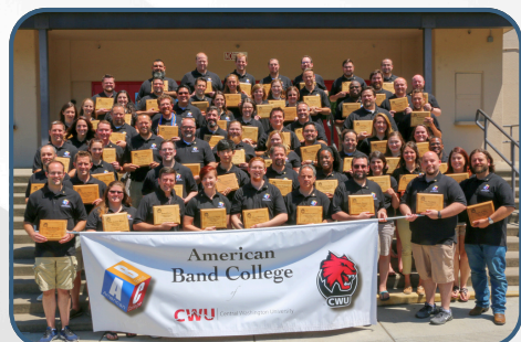
The ABC Graduating Class of 2019