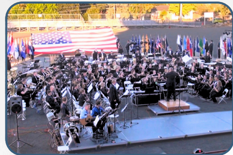
2016 Premiere "That Our Flag Was Still There"